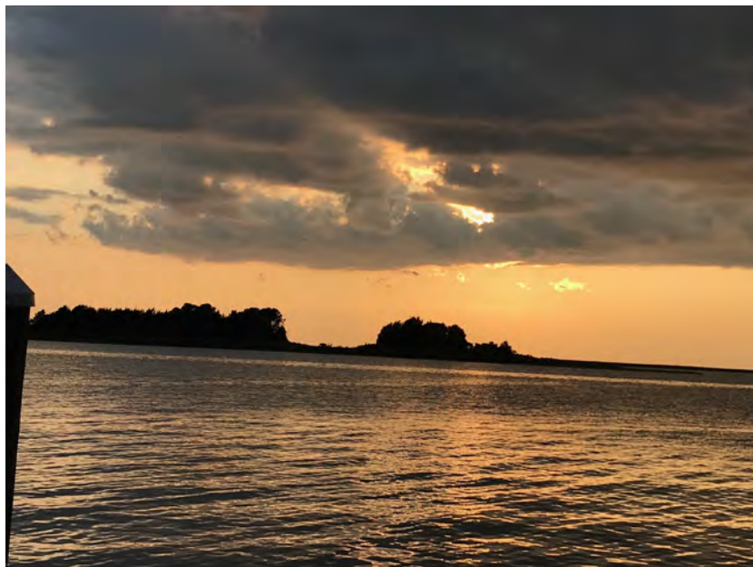
Beautiful sunset in Crisfield, MD